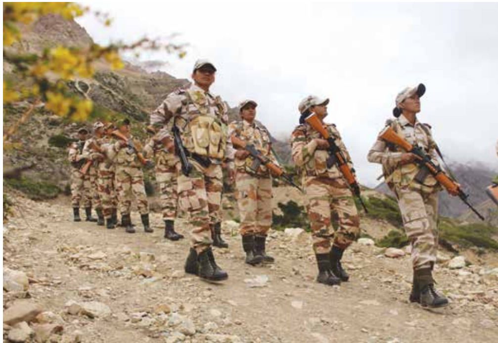
Women officers in combat role stand equally with men in ITBP.