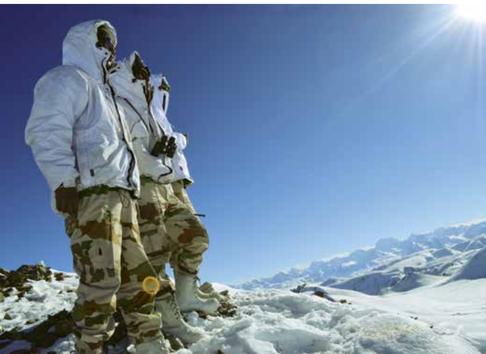
ITBP personnel in Ladakh.

All units have been instructed to adhere to the motto of 'Say no to Plastic' in their campuses. ITBP has also made pioneering efforts in introducing the use of solar energy