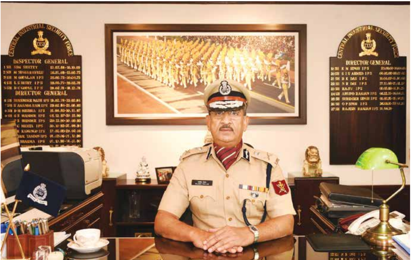
Rajesh Ranjan, Director General of Central Industrial Security Force (CISF).

DSA: Terrorists in Africa have used the truck bomb as a means of mass indiscriminate destruction. We, in India, have just experienced the Pulwama attack. Are such attacks preventable?