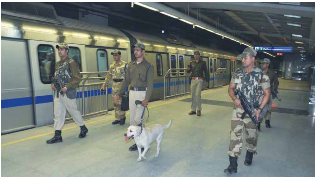
CISF personnel patrolling at Metro Station.