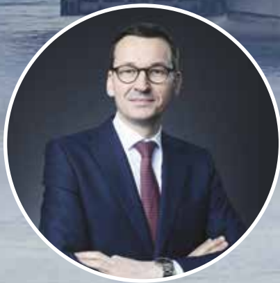
Interview with Mateusz Morawiecki PM of Poland