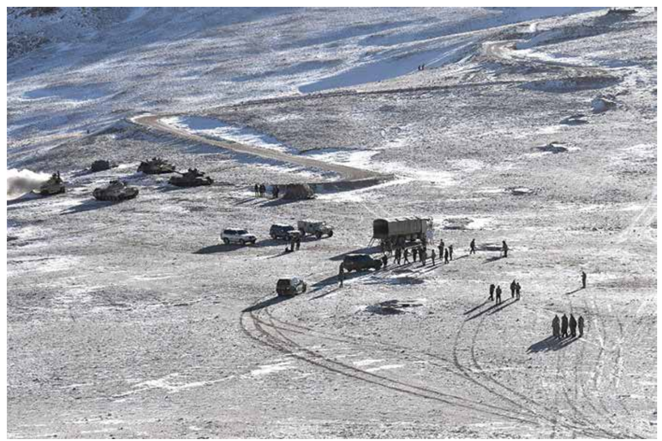
PLA soldiers and tanks disengage along the Line of Actual Control at the India-China border in Ladakh.

The writer is a Strategic Thinker, Geostrategist, Knowledge and Perception Management Consultant, an Educationist, Mentor and Earth Scientist of International repute, a distinguished Thought leadership trainer and author of 43 books.