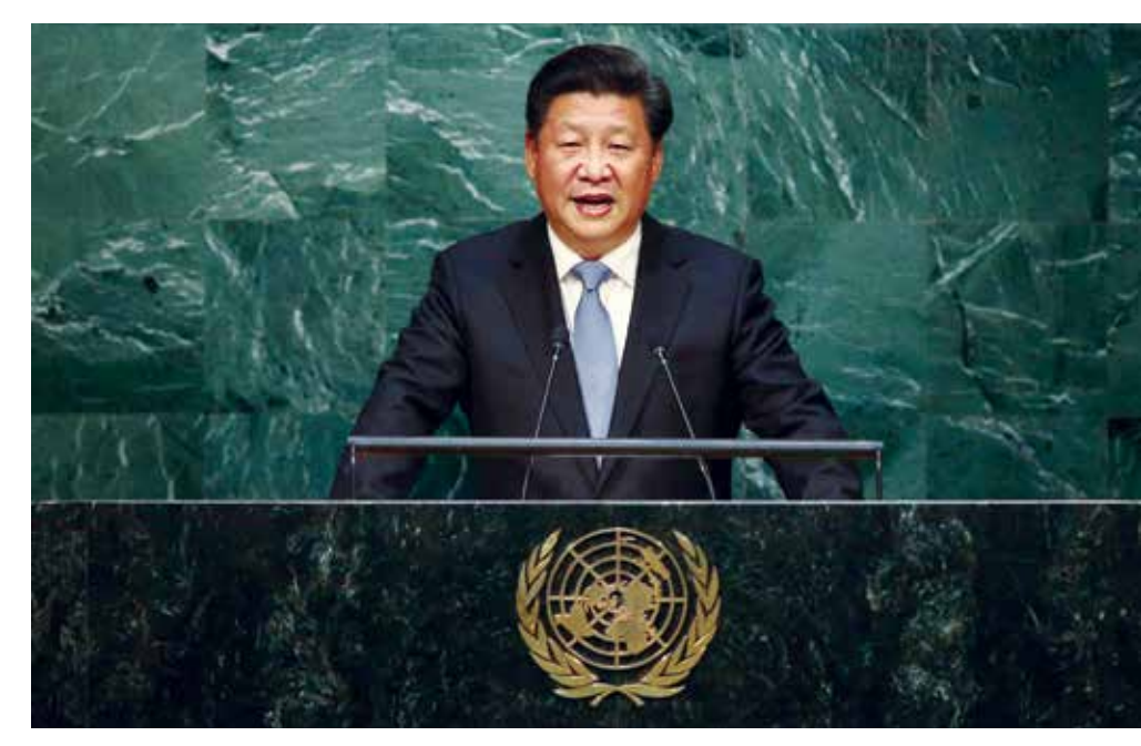
President Xi Jinping addresses the session of the United Nations General Assembly.

China has steadily brought Indian security under pressure through unconventional instruments, like reengineering the cross-border flows of rivers, and nibbling away at disputed Himalayan territories. China engages in every warfare possible to strike at core Indian interests. "If India is weakened militarily and economically, its value as a counterweight to China and the broader US goal of countering China's regional influence would also be undermined," writes Daniel S. Markey, Council on Foreign Relations.