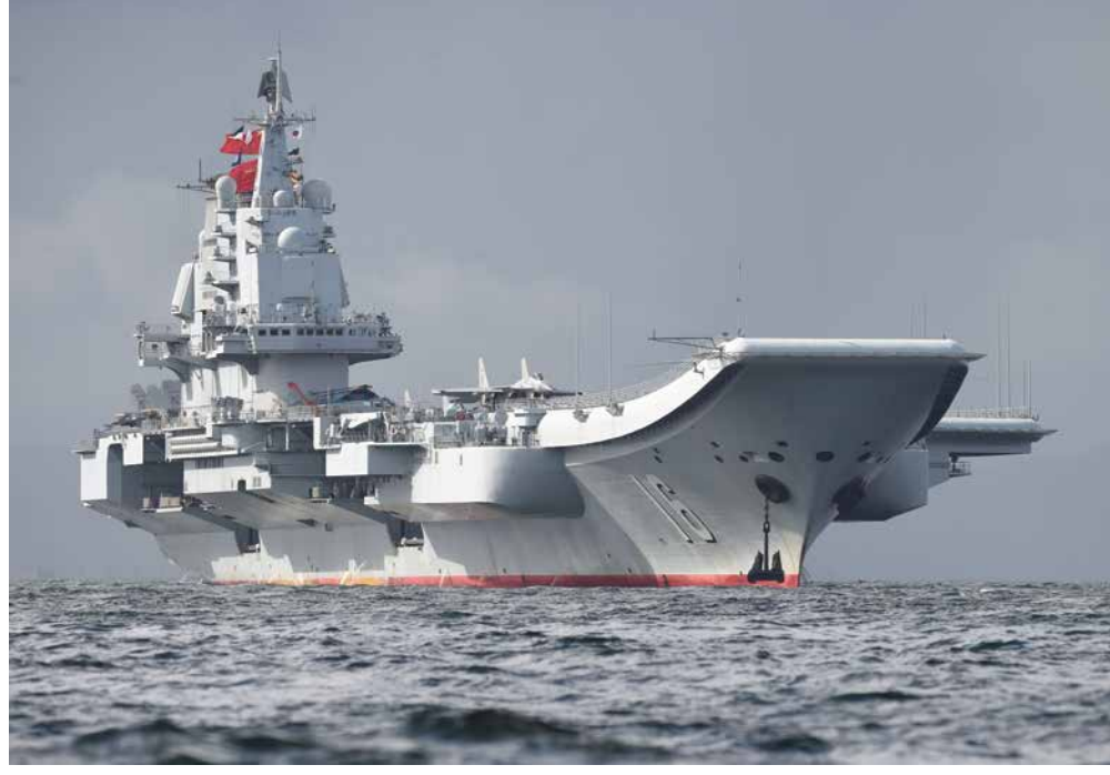
Chinese aircraft carrier Liaoning.

China's claim of sovereignty over the South China Sea; its territorial aggressiveness; its handling of