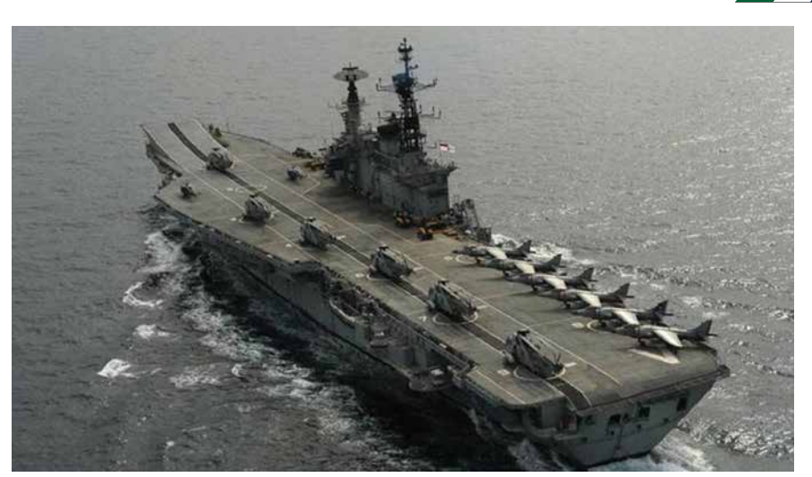
Since its commissioning into the Indian Navy, Operation Jupiter was INS Viraat's first major operation in July 1989, as part of Indian Peace Keeping Operations in Sri Lanka in the wake of the breakdown of the Indo- Sri Lankan Accord of 1986.

at best, a fallacious argument. At any rate, the hesitancy to go into "harm's way" only occurs when the fleet force package is wanting in material and technological capabilities. The three 'assertions' are, therefore, rather eclectic in form and tendentious in content, particularly in light of the unique attributes of the Fleet Carrier.