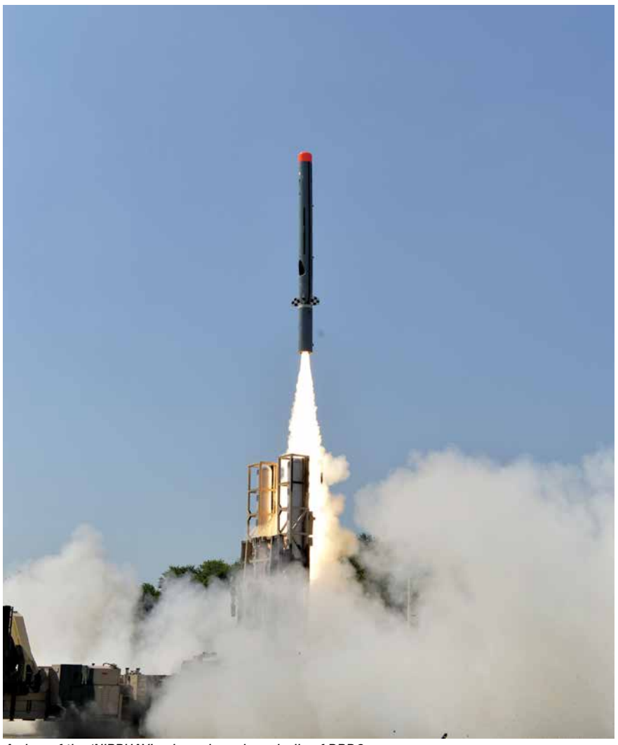
A view of the 'NIRBHAY' sub-sonic cruise missile of DRDO.

In the current combat environment characterized by fluidity , the capabilities needed in one situation may not be the same in another