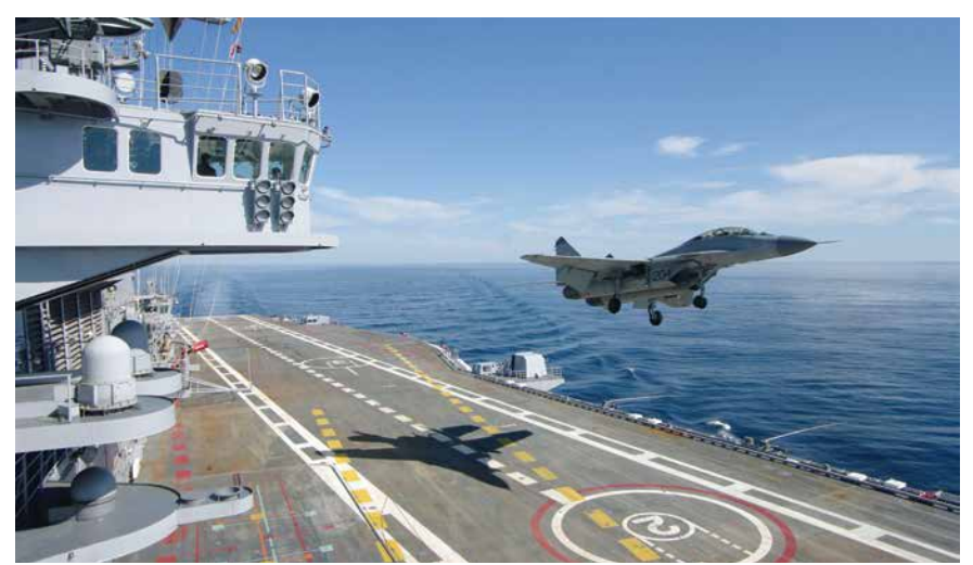
A MiG-29K fighter takes off from the Indian Navy's Vikramaditya aircraft carrier.

maritime crises. These virtues may be summed up in the platform's intrinsic ability to operate in international waters independent of territorial and political constraints; the carrier's Mobility allows it to deploy its full array of combat