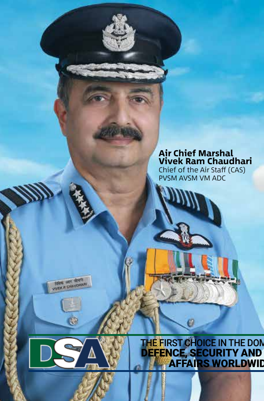
Air Chief Marshal Vivek Ram Chaudhari Chief of the Air Staff (CAS) PVSM AVSM VM ADC